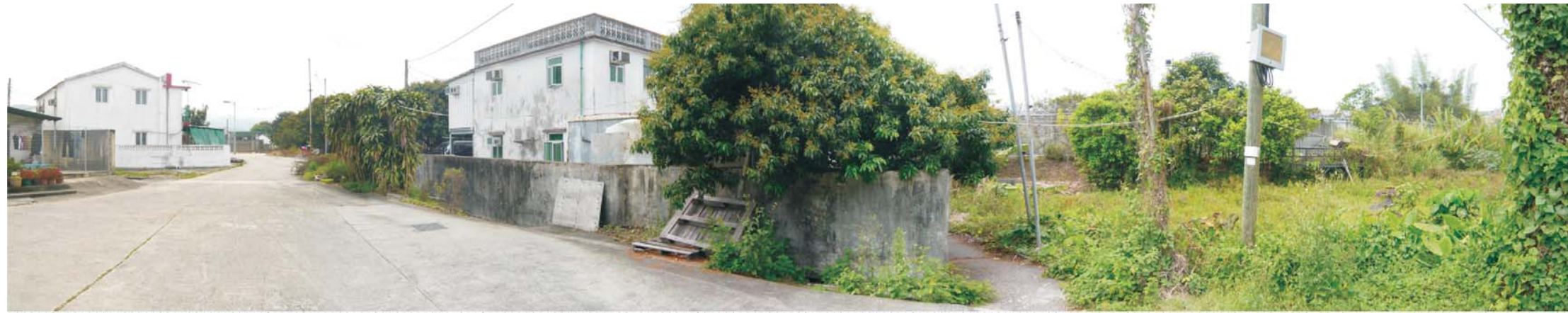
Existing condition from Kaw Liu Village Towards the Project Site.