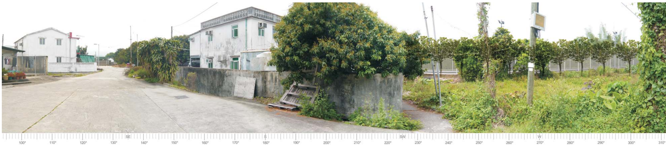
View displaying the 3D Model of the Project with Mitigation at Year 10 Operation.